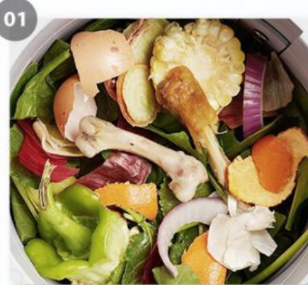
Crush the hard bones