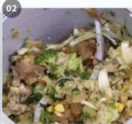
Smash to pieces