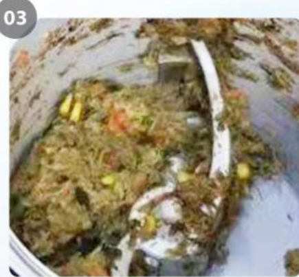
High efficiency dehydration